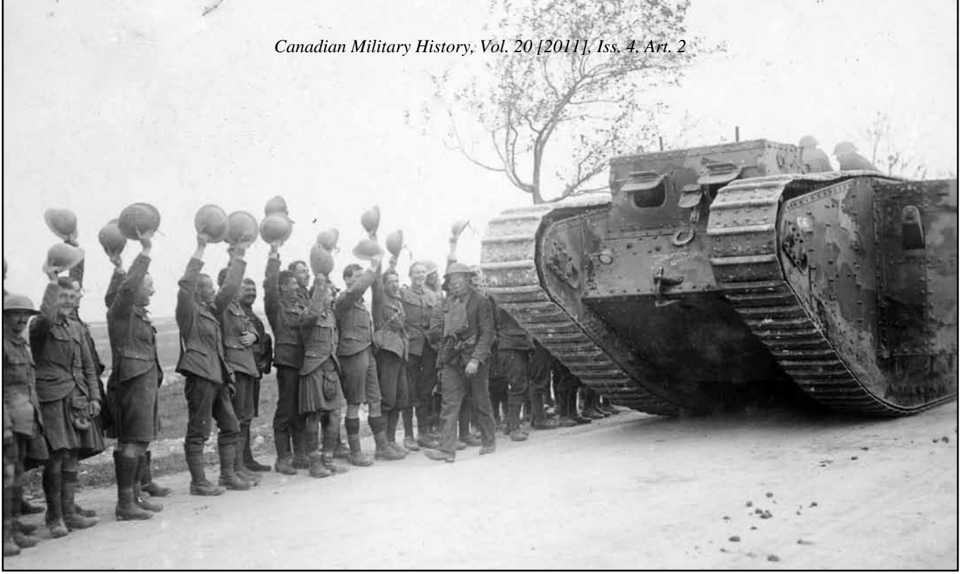
Canadian troops cheer Cordon Rouge (C.6) after the battle. The horseshoe affixed to the front of the tank provided the good luck needed for the tank to complete its mission of 15 September. Cordon Rouge supported the attack by the 4th Canadian Infantry Brigade and was one of only two tanks supporting the Canadians to avoid getting stuck or knocked out.

Sources from the 4th CIB do not provide as much detail on the performance of tanks, but a range of evidence indicates that its experience on 15 September closely resembled that of the 6th CIB. The 21st Battalion formed the left flank of the 4th CIB and was tasked with assaulting the Sugar Factory. In the words of a brigade report, the refinery “was known to be a strong position and it was expected would be defended with determination.” 60