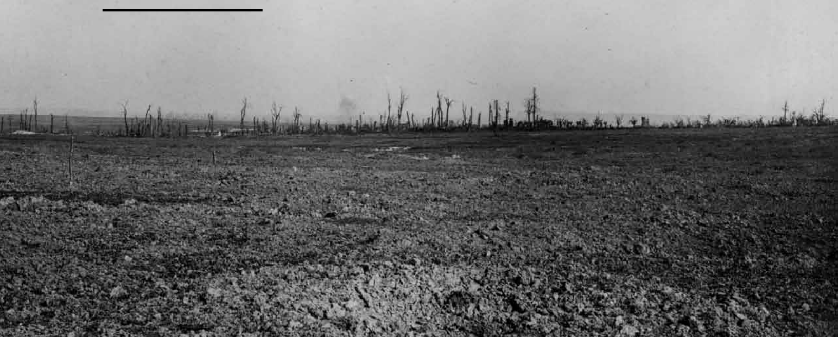
Courcelette after the battle.

Not everyone agreed that the tanks were a success on 15 September. The fact that only two of the six tanks assigned to the 2nd Canadian Division, and two out of the four detailed to assist the New Zealand Division, were able to cross the start line indicates that significant improvements in tactics and technology would be required for the tanks to become truly effective. Years later Winston Churchill complained bitterly of the lost novelty of the tanks "for the mere petty purpose of taking a few ruined villages." 108 Lieutenant-Colonel