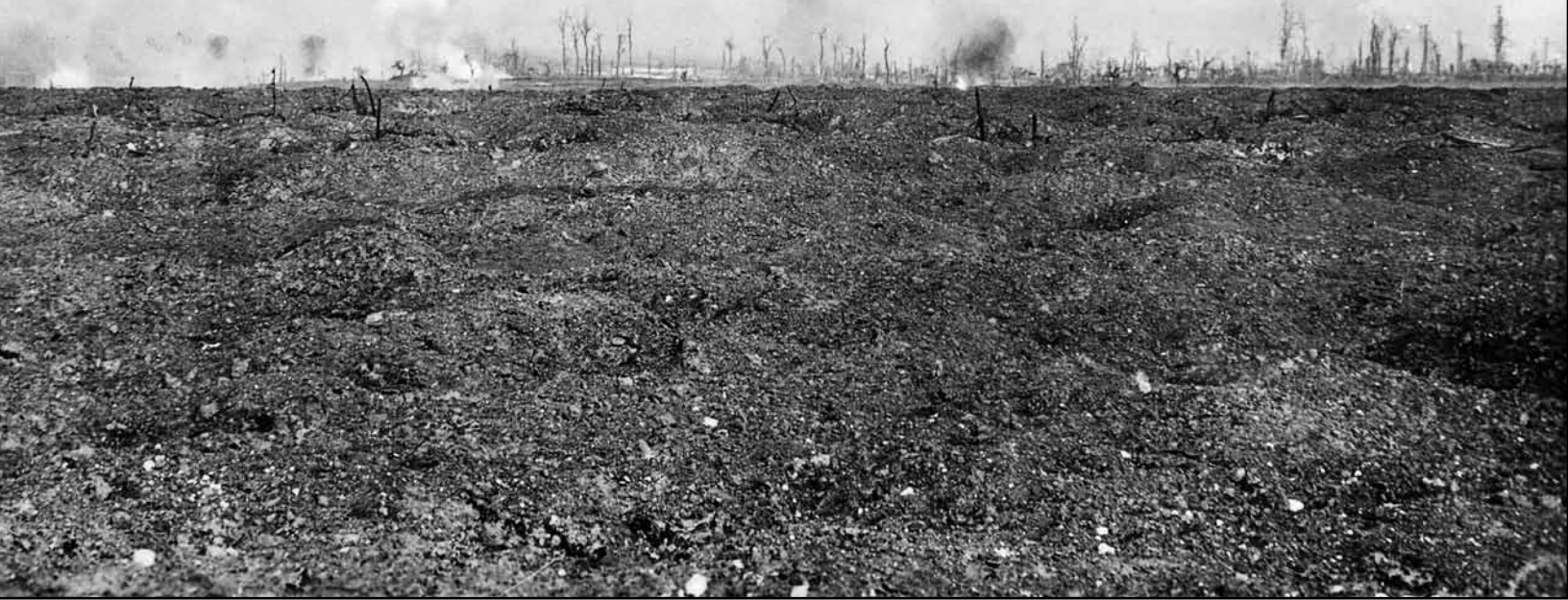
The shell-scarred Somme battlefield. This photo was taken during operations on 15 September 1916 and shows the ground over which the Canadians attacked. The ruins of Courcellette are visible amongst the shell fire and battered tree line.

stipulated that the tanks' "role is to destroy the hostile Machine Guns and Strong Points, and clear the way for the infantry." 35 The infantry were instructed to call for help from tanks by signalling with their rifles and helmets in the event that they were held up by stiff German resistance. The attack was not to depend on tank assistance. The same operations order noted carefully that "should the tanks become out of action our Infantry are on no account to wait for them," and the infantry would keep up the pace of the advance to "derive the benefit of the artillery barrage." 36