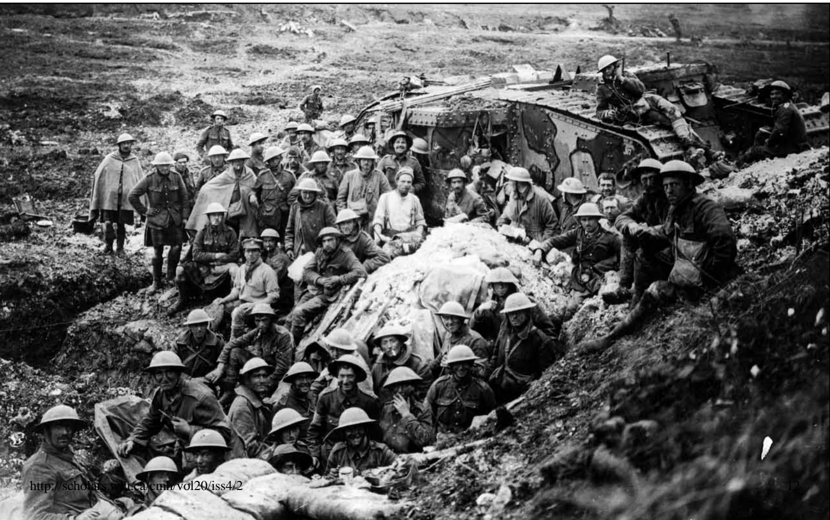
Below: Tank D.17 (Dinnaken) supported the British attack on Flers. It advanced up the main street of the village and materially assisted its capture by directly engaging numerous German machine gun positions. After its armament was disabled, the tank was able to make its way back to safety. Here, a group of British soldiers pose with D.17 following the battle.