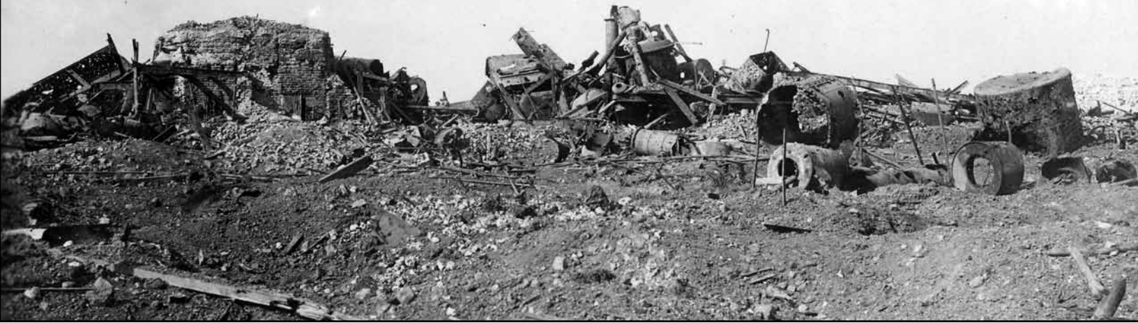
Above: The ruins of the Sugar Factory photographed shortly after the battle.

Right: "The Capture of the Sugar Refinery at Courcelette by the Canadians on September 15, 1916" by Fortunino Matania. This dramatic re-creation of the Canadian action to capture the Sugar Factory faithfully captures the actual battlefield - compare to the photo above.