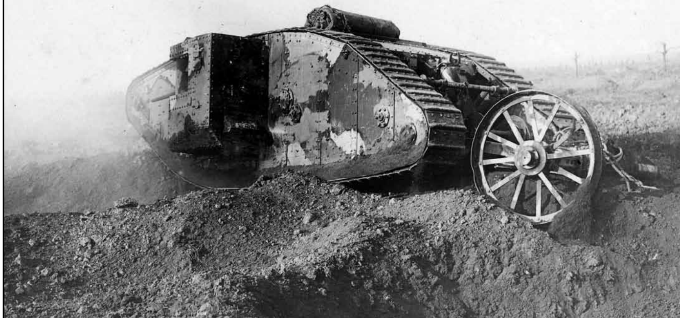
Here, C.5 (Crème de Menthe), a Mark I tank traverses the Courcelette battlefield, September 1916. C.5 was a male variant armed with two naval 6-pounder guns and four Vickers machine guns. The female variant replaced the 6-pounders with two additional Vickers machine guns. The two-wheeled trailer pulled behind the tank was a steering tail used to help control the direction of the vehicle.

slaughter. The combination of deep German entrenchments and dense barbed wire that survived the long British artillery bombardment, coupled with lack of surprise meant that the defenders were well-prepared. Over 19,000 British and Empire soldiers were killed and some 38,000 wounded on the first day of the attack alone. 12 Undeterred by the scale of the losses, Haig continued to push. By late August, roughly eight square kilometres of German-held territory were captured at a cost of 100,000 British casualties. 13 German strongholds such as those at Thiepval and High Wood, and the Quadrilateral trench network continued to elude capture even after months of horrific fighting.