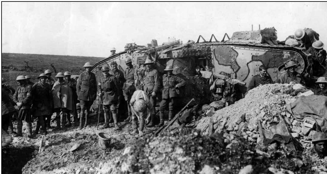
Another view of D.17 following the battle. The tank remained in location here for several days before being recovered. It was used as a brigade headquarters during this period. Here the brigadier (with cane) and his staff pose for a photo during a lull in the battle.

D.11 and D.12 were the only tanks able to help the New Zealanders on 15 September, the other two being disabled by German fire. 87 The actions of these two tanks nevertheless received glowing praise from most of the New Zealand regimental histories of the battle. The NZRB history by Lieutenant-Colonel W.S. Austin states that the tanks "came well up to expectations." 88 Despite the heavy casualties suffered by the Otago Regiment's 2nd Battalion, the regimental history by Lieutenant Arthur Byrne concludes that the tanks "did actually perform extraordinarily effective work" by "breathing death and destruction." 89