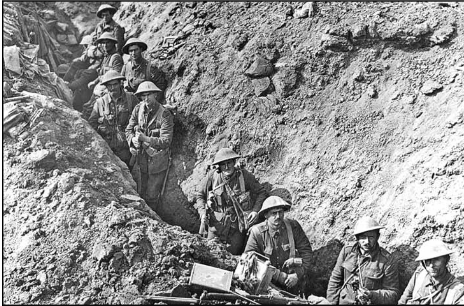
Left: Soldiers of the New Zealand Division stand in a front line trench near Flers, 15 September 1916.

support while D.12 "proceeded to deal with the wire and machine-guns holding up our men." 84 The 3rd Battalion was then able to surmount German opposition and capture Flers Trench. The New Zealanders fell short of the ultimate objective of Gueudecourt, but were able to advance to the third objective of Abbey Road Trench by 1100 hours. 85 Their roughly 2,230 metre push was one of the farthest advances of any division on 15 September. 86